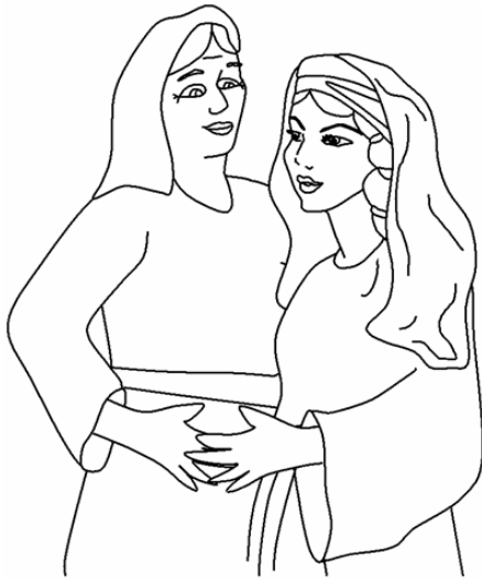
Ruth & Naomi